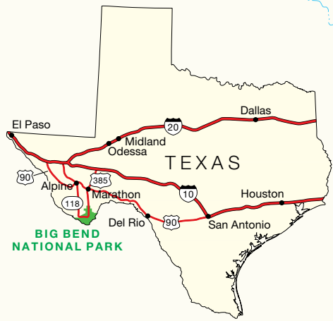
BIG BEND NATIONAL PARK